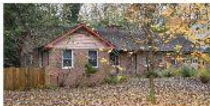
30 Wainwright Ave