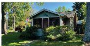
1 East Lake