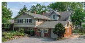
143 East Lake