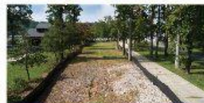
86 East Lake