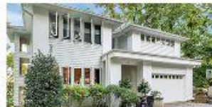
186 West Lake