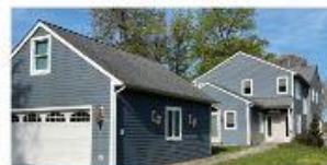
72 East Lake