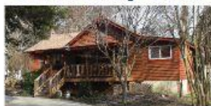
31 Wainwright Ave