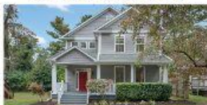
29 Lawrence Ave