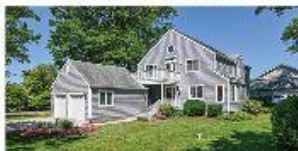
23 Sands Ave